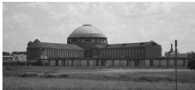
East Jersey State Prison "Rahway" - Scene of the crime